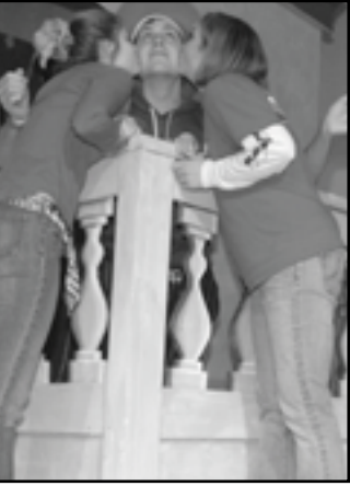
'Scapino!' appeals to even the Bugs Bunny lovers