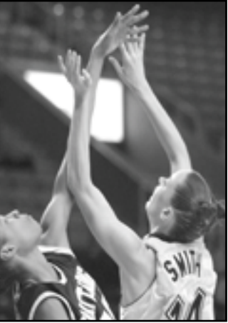
Mountaineers drop fifth straight game