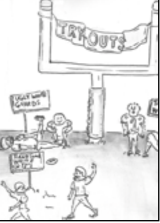
Black quarterbacks have earned just due